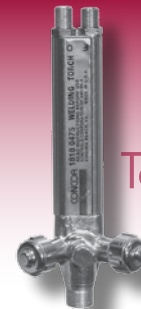
Style 475 Tote-Weld II